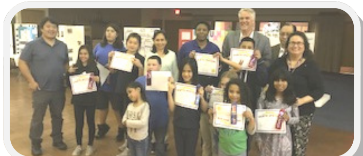
LJA Teachers with the 2020 Science Fair Winners and Judges