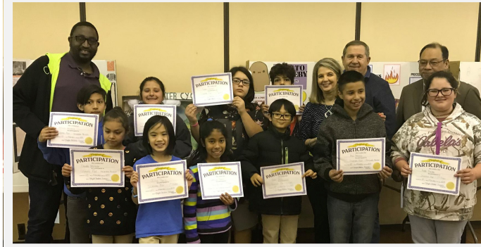
Judges with LJA Students