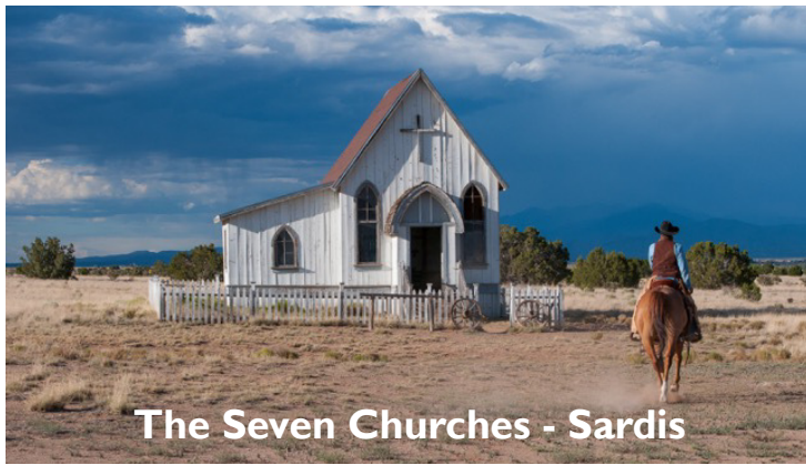
The Seven Churches - Sardis

While finishing my time at Southwestern Adventist University, it was suggested that I visit a psychologist or counselor as part of a mental health checkup. Many people have a stigma about this because we are made to feel that only "the crazies" seek out professional help. I went, and it was very beneficial to me. I received some good advice that helped me work on some deficiencies that I had unknowingly been developing.