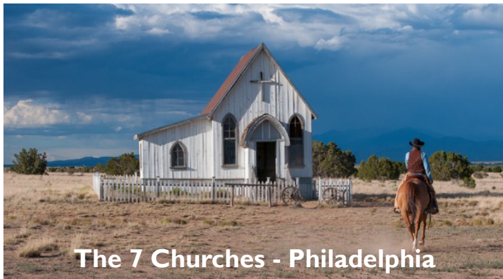
The 7 Churches - Philadelphia

"The moment someone chooses to trust in Jesus Christ, his/her sins are wiped away, and he/she is adopted into God's family. That individual is set apart as a child of God, with a sacred purpose." -Charles Stanley