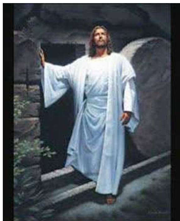
UP FROM THE GRAVE HE AROSE!!